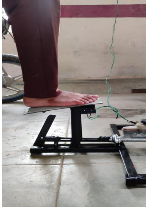
Fig: 10- Acceleration

For acceleration a pedal is pin jointed to a steel segment. By utilizing pin joint the pedal can move in clockwise and anti-clockwise. The pedal is worked utilizing the foot. Presently, a switch is welded to the steel section. This switch does the activity of on/off. This switch is interconnected to the motor. By moving the pedal in clockwise heading, the pedal presses the switch gave to the section. By squeezing it the power passes from the switch to the motor and the motor begins to rotate the wheel hub. By releasing the tension on the pedal comes to impartial position and the power is cut off from the motor.