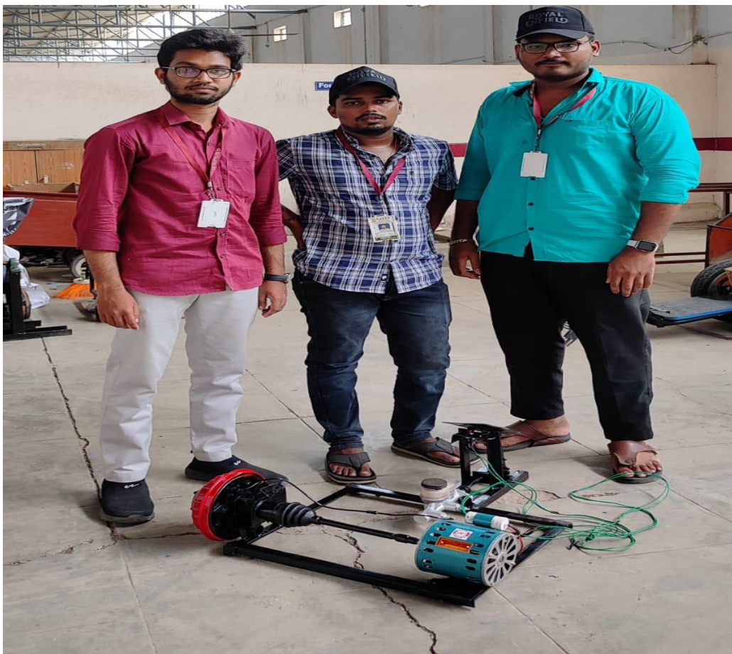
Fig 9: -Fabrication Model

The working principle of the single pedal for accelerator and brake is categorized into two different action. The first one deals with the acceleration action and the second one deals with the braking action.