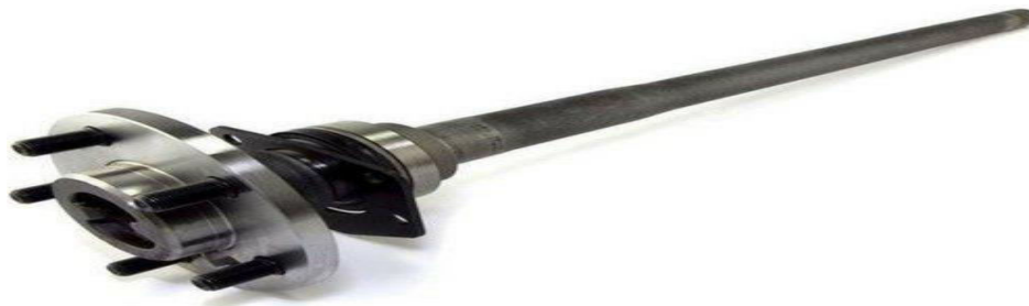
Fig 5: -Axle

A axle or axletree is a focal shaft for a turning wheel or stuff. On wheeled vehicles, the axle might be fixed to the wheels, turning with them, or fixed to the vehicle, with the wheels turning around the axle. In the previous case, bearing or bushings are given at the mounting places where the axle is upheld.