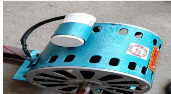
Fig 4: -AC Motor

More uncommon, AC linear motor work on comparative standards as rotating motor yet have their fixed and complex components organized in an orderly fashion design, creating straight movement rather than revolution. The AC motor we are using here can produced power upto 0.25hp.