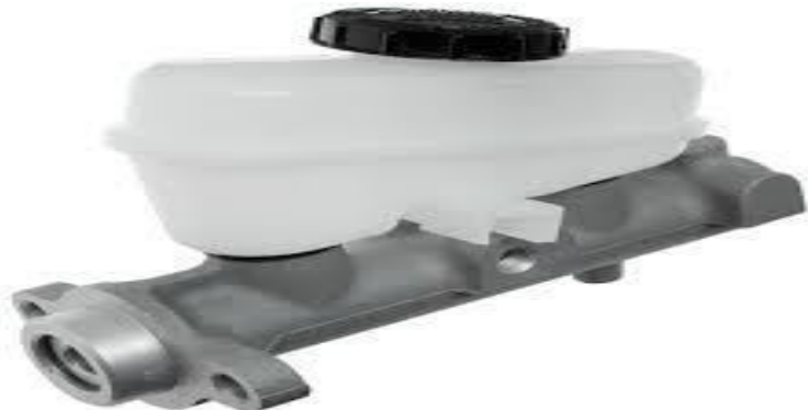
Fig 3: -Master Cylinder

In automotive engineering, the master cylinder is a control device that converts force (regularly from a driver's foot) into hydraulic pressure. This device controls slave cylinder situated at the other end of the hydraulic brake system.