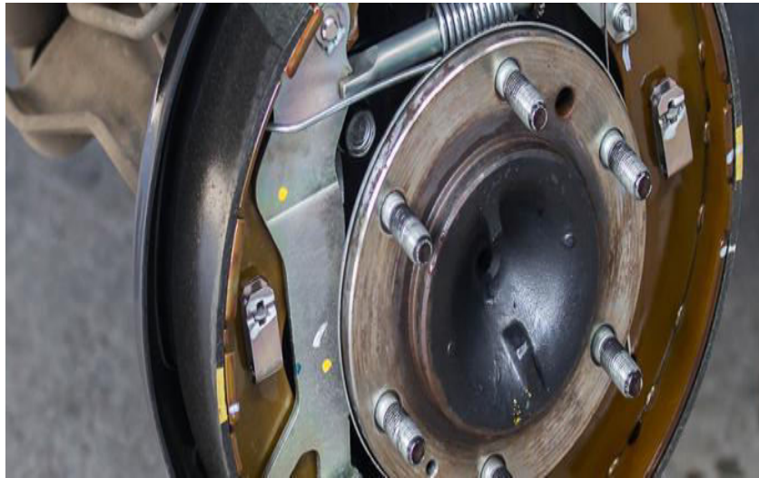
Fig 8: -Drum Brakes