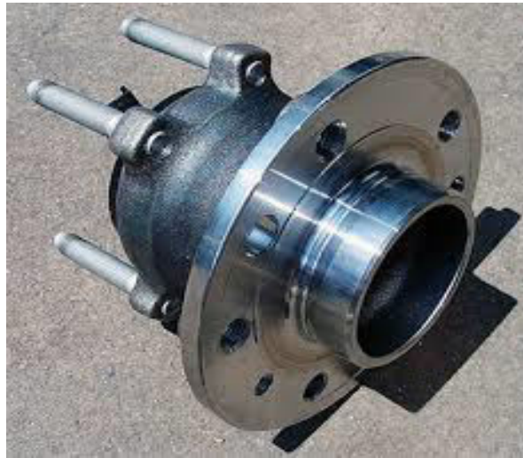
Fig 6: -Wheel Hub