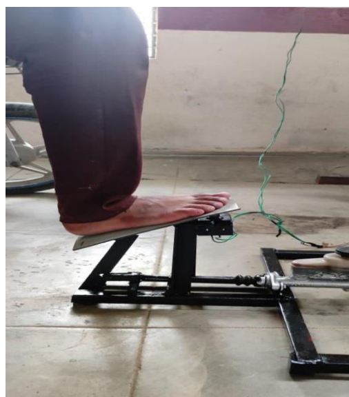
Fig: 13- Neutral Position

The neutral position is the position at which the both action acceleration and braking are not active. At this position the drivers foot remains in rest.