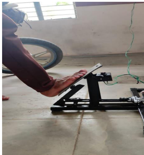
Fig: 12- Braking

Presently a steel pole which is pin jointed to the edge is kept unreservedly on the pin joint of the push rod. A round bar is joined to the furthest limit of the pedal. At the point when the pedal is moved in anti-clockwise heading, the pedal pushes down the steel bar which thusly moves the push rod of master cylinder in forward bearing. At the point when the push rod moves in forward course it compresses the brake fluid inside the master cylinder. The compressed brake fluid is moved through the brake lines and shipped off the brake drum inside the wheel hub. Subsequently the brake liners are extended inside the brake drum and applies the brake to the wheel hub. By releasing the tension the brake are separated and the strain diminishes inside the master cylinder and comes to original position.