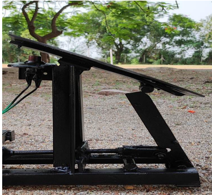
Fig 2: -Pedal