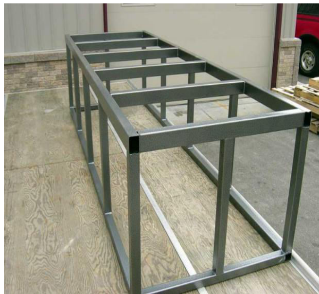
Fig 1: -Frame

The frame in the below model is supporting the Motor, Wheel hub, Brake drum, Axle, Braking system, Pedal, Master cylinder etc., The frame absorbs the vibration coming from the motor, wheel hub and brake drum. It resists the moments which are developed inside the components.