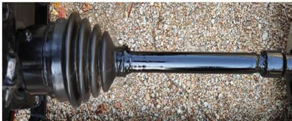
Fig 7: -Propeller Shaft

As torque carriers, drive shafts are dependent upon twist and shear pressure, identical to the contrast between the input torque and the heap. They should subsequently be sufficiently able to bear the pressure, while staying away from an excessive amount of extra weight as that would thus build their latency.